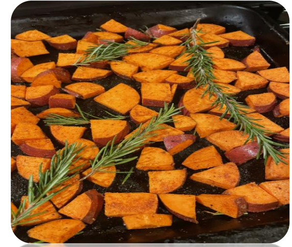
Why is sweet potato a Superfood? They're loaded with beta carotene, a potent antioxidant and a rich source of vitamin A.

These will not only fail to horrify but will be requested again and again as your contribution to a holiday dinner. Use as an appetizer or side dish any time of year.