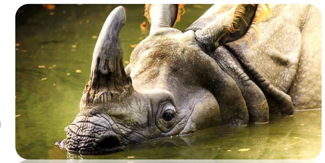
Once the most widespread of Asian rhinoceroses, only 60 individual Javan rhinos remain, hunted nearly to extinction due to ignorant lore about their horns.

It's so much more than the loss of one species. It's the destruction of an entire ecosystem. It's the transformation of lush forests, wetlands and green lagoons teeming with life into a giant dead mudflat. It's the devastation of the indigenous <a href="Cucupa">Cucupa</a> "River People". It's personal.